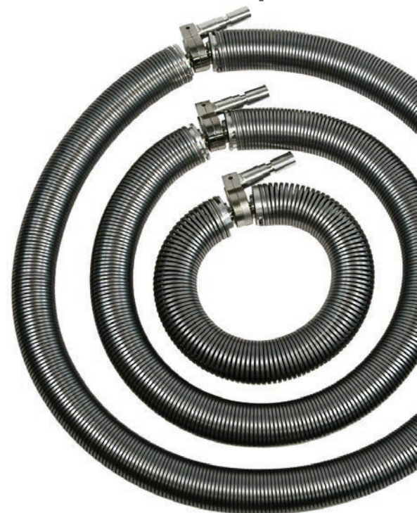
Rolling Spring Electrodes

For a complete list of available electrodes visit www.defelsko.com/hhd