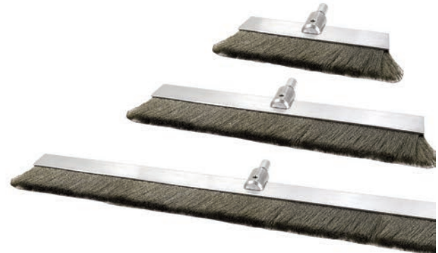
Flat Wire Brush Electrodes