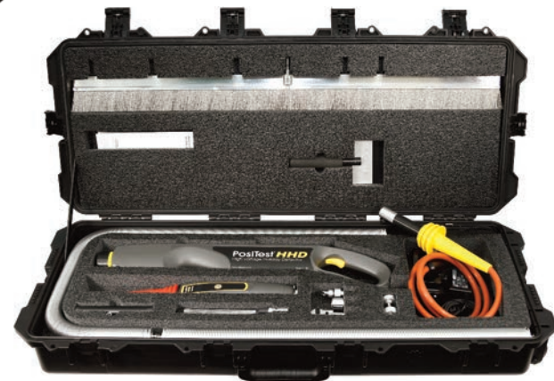
PosiTest HHD shown with optional electrodes and accessories